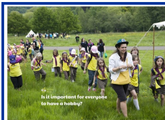
Is it important for everyone to have a hobby?

Think about how some hobbies and activities that we take part in can make the world better, e.g. charity work or being involved in a fun run.