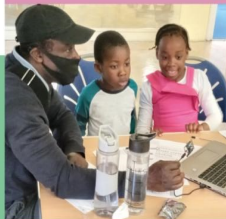
Help your children with English and maths