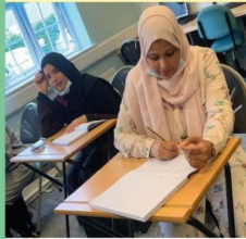
Free online courses for parents