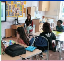
Courses starting soon